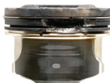
Piston head after 10,000 miles

Super Pro Max Engine Oils provides exceptional protection and keeps engines cleaner for extended drain intervals in all operating environments.