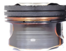
Piston head after 45,000 miles